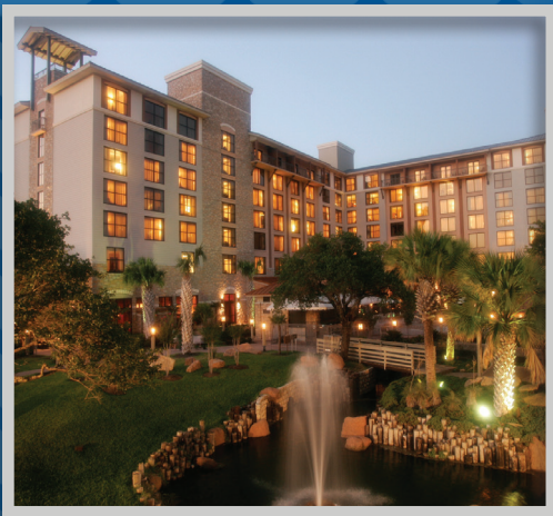
JW Marriott Horseshoe Bay 200 Hi Circle North, Horseshoe Bay, TX 78657